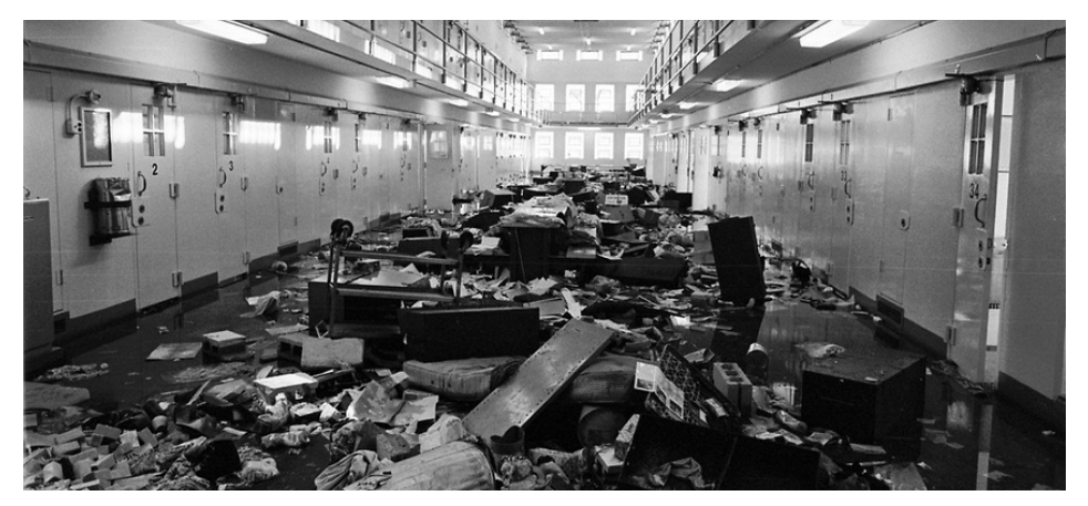
CONCLUSION: MAKING PRISONS IMPOSSIBLE

On September 9th of 2016, the 45th anniversary of the Attica uprising, prison rebels engaged in diverse protests against their captivity, exploitation, and the systems of capitalism and white supremacy. According to estimates gathered by prisoner supporters, there were over 57,000 prisoners affected by the action that impacted at least 46 facilities across the nation <sup>1</sup>. Solidarity Research calculated that the strike cost the California prison system alone $636,068 in revenue each day (2016). The events of September 9th also broke through the typical media blockade around prisoner resistance, gaining