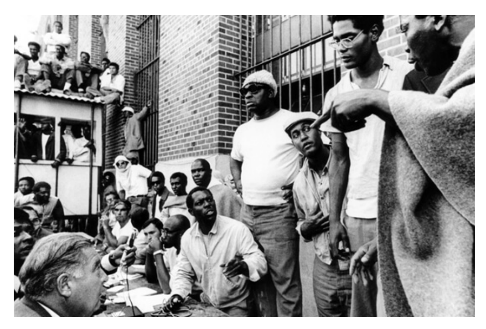
PRISON REVOLTS: RESISTING CIVIL DEATH, CREATING POLITICAL SPACES

I urge each and every one of you to imagine yourself drowning... All your training goes out the window, but your survival instincts emerge. You were taught to not flail about when drowning, yet at the moment of drowning, you do flail. Was I not to flail? Was I supposed to accept death by suffocation in [this] sweat box?